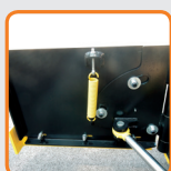
Lateral adjustment hatch