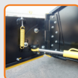
Hydraulic control hatch